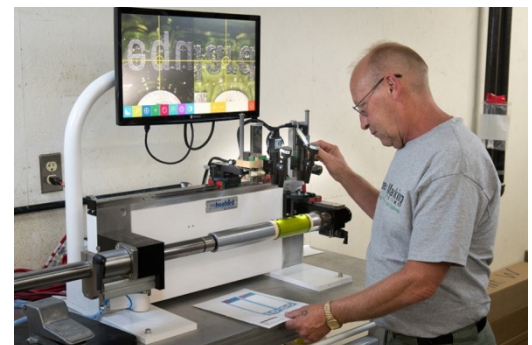
Mounting of Printing Plates