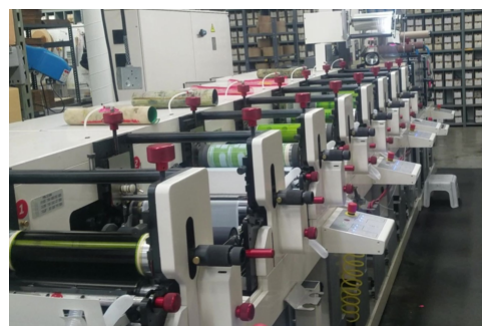
8 Color Flexo Printing Press